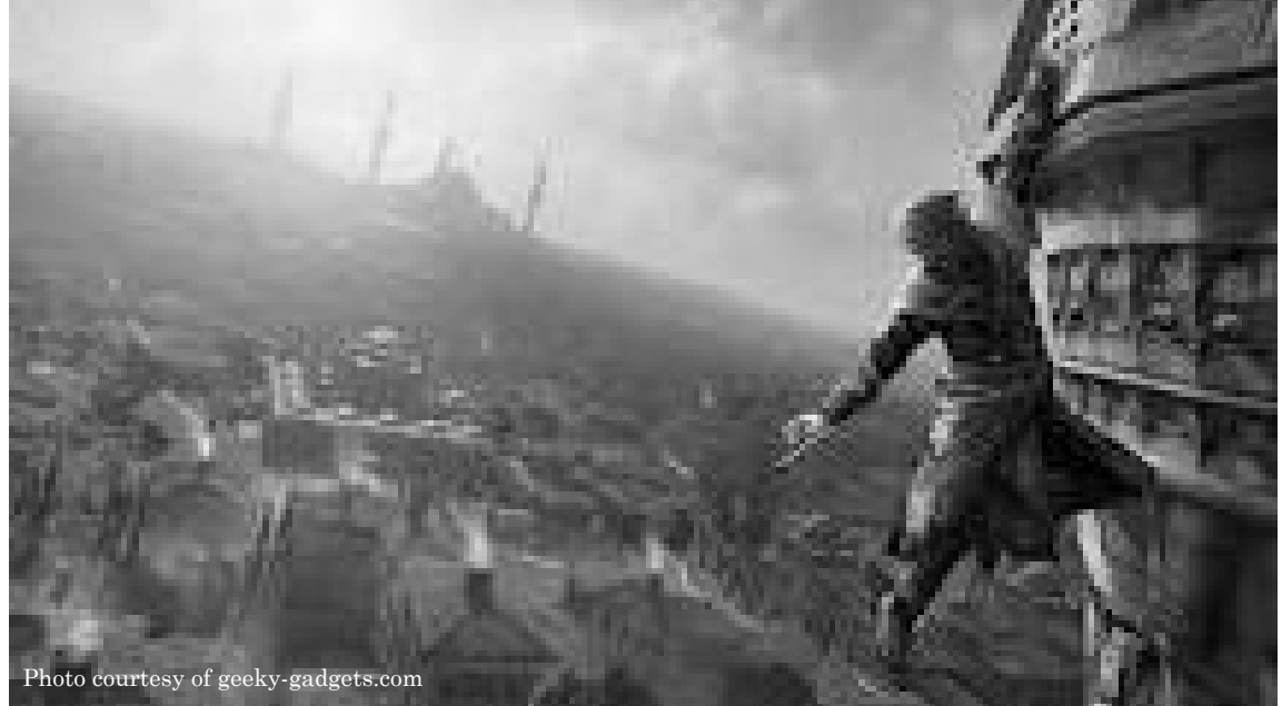
The bombs are made up of the ordinance, gunpowder, and the casings, while Broth climb up minarets and then base jump from them with great ease.

Now, ACR is somewhat different than its predecessor Assassin's Creed: Brotherhood. ACR has more customization capabilities for you can make your own bombs. The bombs are made up of the ordinance, gunpowder, and the casings, while Brotherhood allowed you to purchase only