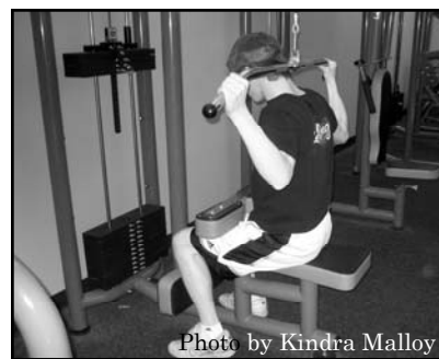
Freeman students hit the weights as part of their physical education classes.

So next time you look at yourself in the mirror and