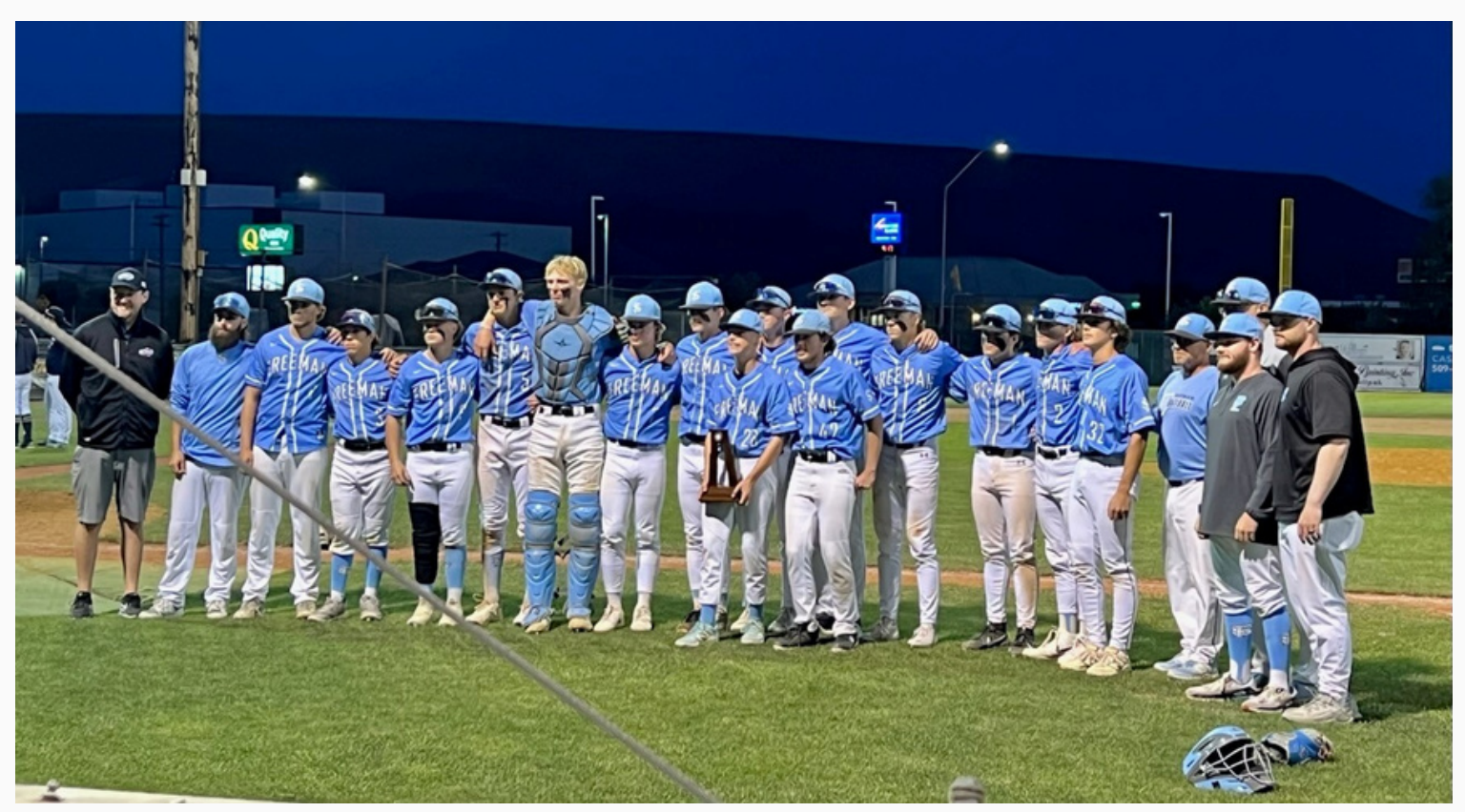
Congratulations Freeman Baseball 2<sup>nd</sup> Place at State!