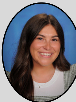
CRICKET SPITZE KINDERGARTEN

I WENT TO 5 DIFFERENT ELEMENTARY SCHOOLS. I LOVE PLAYING BOARD GAMES WITH MY FAMILY - WE PROBABLY HAVE OVER 50 DIFFERENT GAMES!