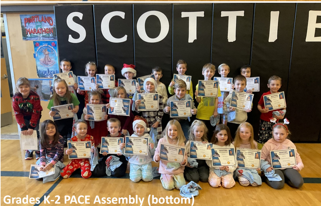
Grades K-2 PACE Assembly (bottom)