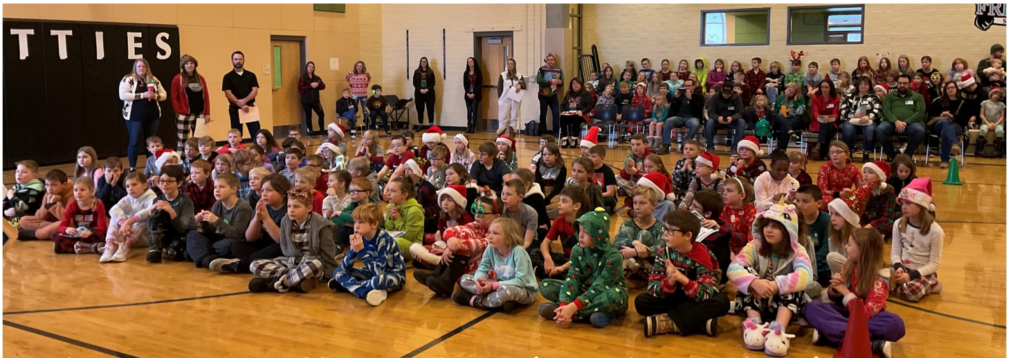
Grades 3-5 PACE Assembly, December 16 (top and center photos)