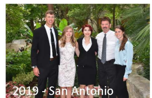
2019 - San Antonio